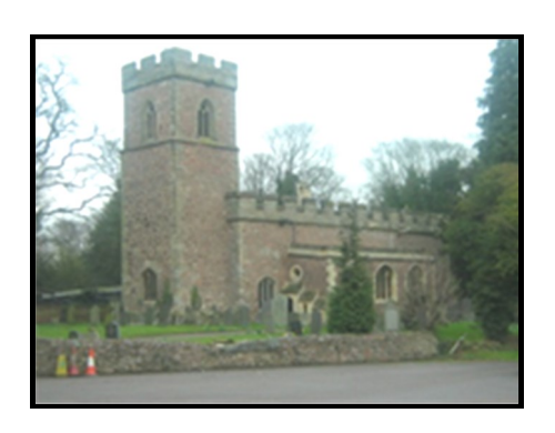
Our Lady & St Nicholas Wanlip